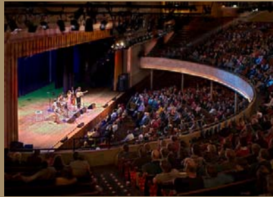
Ryman Auditorium 2004