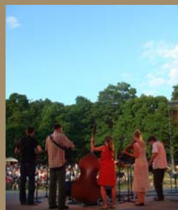
Reading, PA 2007

A Mountain Apart winner of Award for Best Roots CD of 2005.